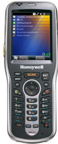
The Dolphin 6110 mobile computer provides advanced data capture and real-time wireless communication for in-premise applications including price lookup/audits, inventory management, customer assistance and merchandising.

Purpose-built for in-premise applications, the Dolphin 6110 mobile computer provides mobile workers with the tools needed to streamline tasks, improve productivity and maximize investment protection.